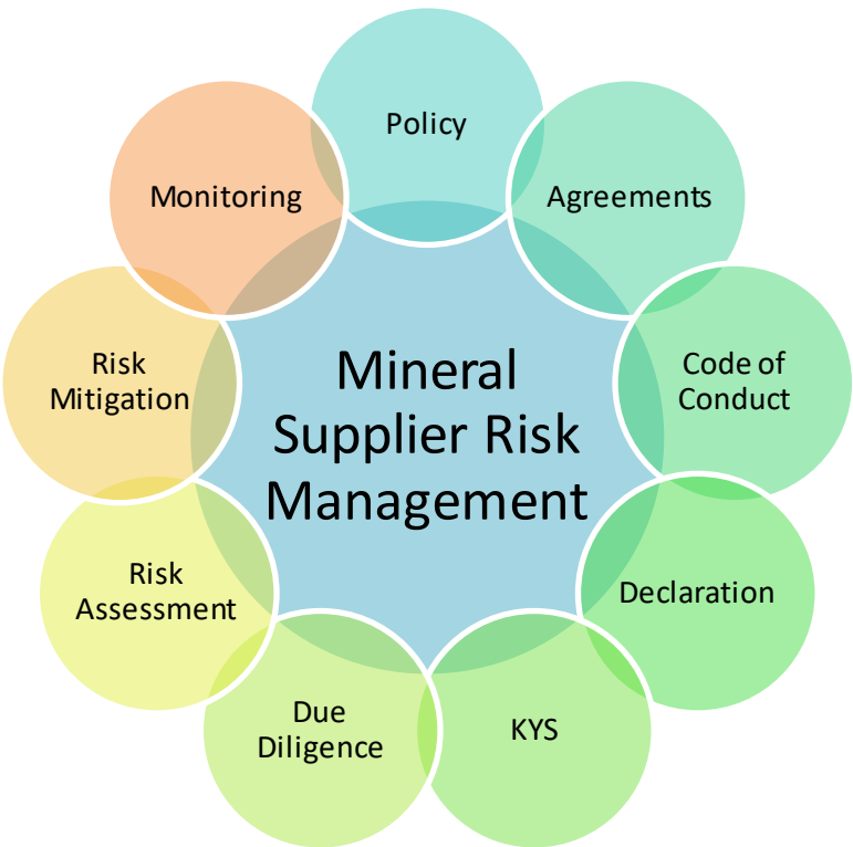
Figure 2. Supplier Risk Management

Engagement with suppliers to assess and improve their due diligence performance is conducted regularly. In 2024, Sherritt engaged with Moa Nickel, its own JV mine and largest supplier, to develop a CAHRA methodology. Engagement also includes regular calls and meetings with third-party suppliers to review and discuss Sherritt’s Responsible Production and Supply Policy and Supplier Code of Conduct requirements as well as KYS questionnaires and supplier declarations. This is further described below in the section on KYS activities. Sherritt’s approach to mineral feed supplier risk management is represented in Figure 2.